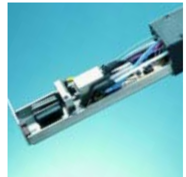
A-Series print head

With all the benefits of Domino's reliability and print quality, the A100 is the ideal choice for basic coding requirements in everyday production environments.