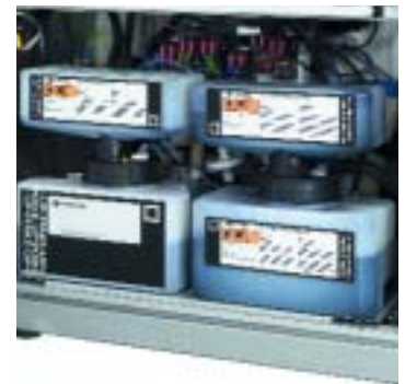
Unique Domino ink system